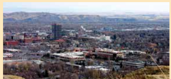
Above: Billings from the Rimrocks, looking east.

Affordable housing, a growing school system and many city parks make Billings family friendly. With two major hospitals, a veterans hospital, cancer treatment centers, heart centers and many medical specialists, our medical corridor serves a three-state area.