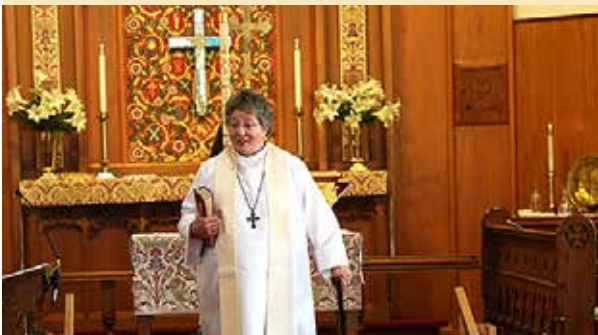
Above: Chapel time for preschoolers Left: Sharing the Gospel during Sunday Eucharist Right: Fellowship while making sandwiches for the Montana Rescue Mission

We honor our past, and seek to meet the challenges of being a downtown church in a growing community, and to share the good news of Christ.